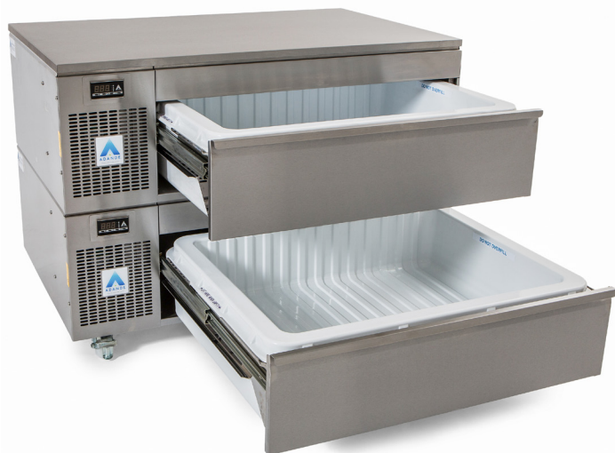
VLS2/CW Standard Castors (C) Solid Worktop (W)