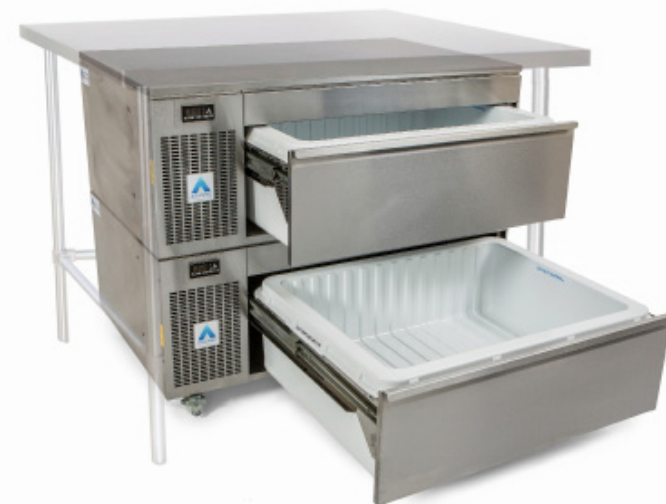
VLS2/CT Standard Castors (C) Cover top (T)

Hydrocarbon R600a Refrigerant (also available in HFC R404a)